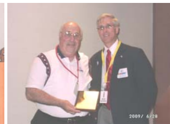
Greater Calumet USBC BA 2009 Most Teams in Open Tournament