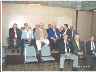
Hall of Fame Members