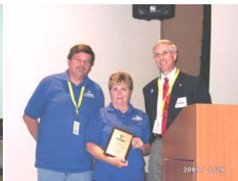
Greater Bloomington BA 2009 Seniors Tournament Host