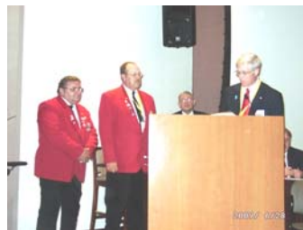
Anderson USBC BA Host of the 2009 IS USBC BA Masters