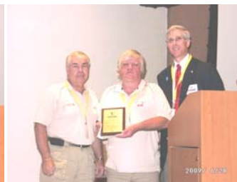
Northwest In. BA 2009 Open Championship Host