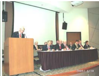
2009 IS USBC BA Members