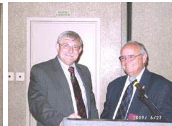
Ron Holder 2009 Hall-of-Fame Inductee