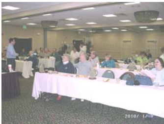
Regional Training Session