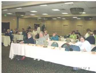
Regional Training Session