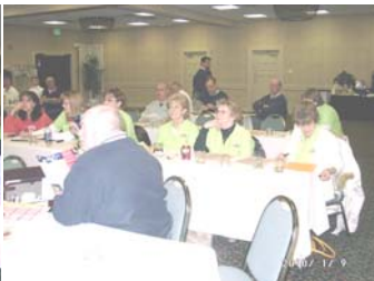
Columbia City USBC WBA