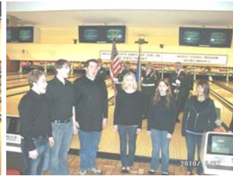
Sounds of the Hill Choir