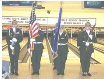
Central High School Color Guard