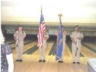
Color Guard V.F.W.